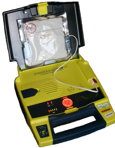
Figure 19.24 Automated external defibrillators are found in many public places. These portable units provide verbal instructions for use in the important first few minutes for a person suffering a cardiac attack.